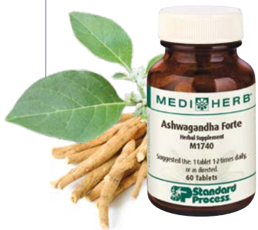
Ashwagandha ( Withania somnifera )

Manufactured to pharmaceutical GMP standards